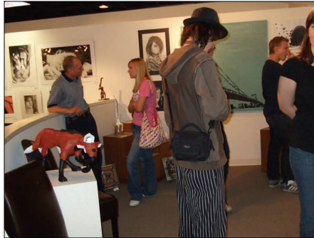
Meet the Artist Reception

My first Gallery event was a panel discussion of national comic artists, which led me to a workshop on making your own mini comic! I have also had the pleasure of meeting