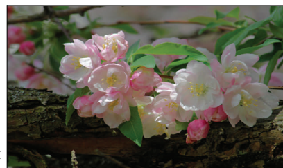
Apple Blossoms- Renee Bardetscher

Dale's work can be found in LAA's Upper Gallery and Gallery Gifts, Cranberries Café in July and the Grand Blanc Art Fair in August. - TF